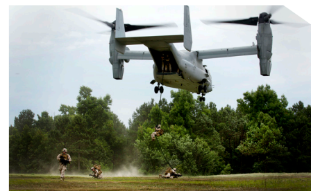
U.S. Marines conduct fast rope training from an MV-22 Osprey over Camp Lejeune.

The Eastern North Carolina Sentinel Landscape will seek to address top priority encroachment concerns identified by the military, including restrictions related to species conservation and potential development of privately owned agriculture, forest, and open space lands. Programs at Camp Lejeune and Seymour Johnson AFB will work with Federal and state partners to offer voluntary landowner incentives protecting aviation training routes through the promotion of compatible land uses, while a program at Camp Lejeune will create high quality habitat for the red-cockaded woodpecker outside the installation in order to forestall anticipated training restrictions inside the installation's boundary. Through the North Carolina Department of Agriculture and Consumer Services, qualifying landowners in the 33-county region will also be able to access funding assistance for implementing best management practices for land and water resource management, which will provide additional income for farmers that will help to deter development while protecting natural resources. Other partners are offering cost sharing opportunities to local governments for conserving priority wildlife habitat, and a pilot concept for a Veterans and Youth Conservation Corps will provide skills and eight months of employment working on coastal conservation projects that also support military objectives and lands around Dare County Bombing Range.