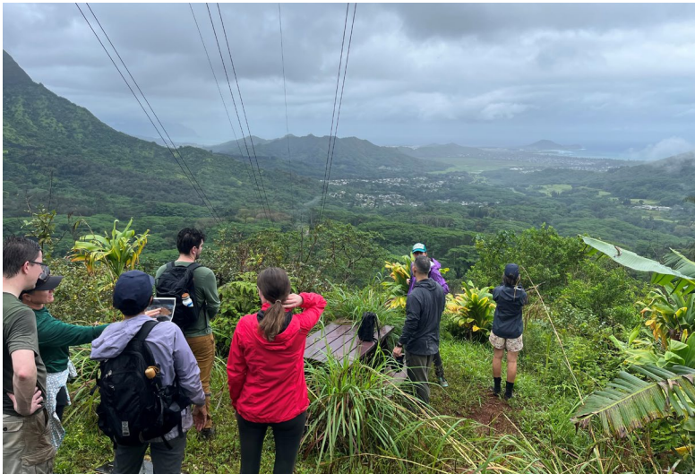
Hawai'i Sentinel Landscape Partners are joined at Maunawili for a site visit to discuss a conservation and resilience project to benefit Marine Corps Base Hawai'i and the surrounding communities.