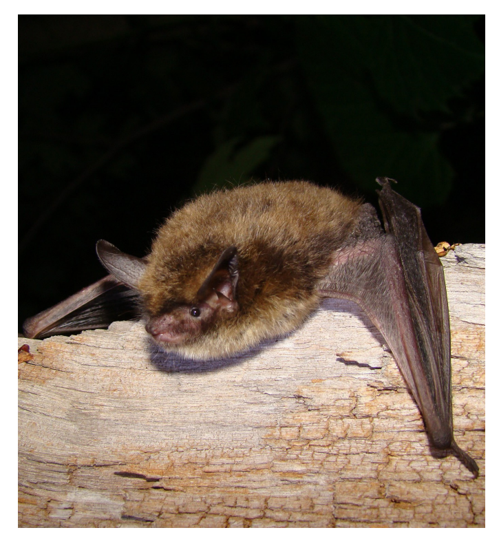
The Southern Indiana Sentinel Landscape protects farms and forests by securing conservation easements and restoring oak-hickory forest ecosystems. This effort benefits federally endangered species such as the Indiana and northern long-eared bats.

Address local impacts of global climate change through built infrastructure and natural climate solutions, fostering a more resilient landscape.