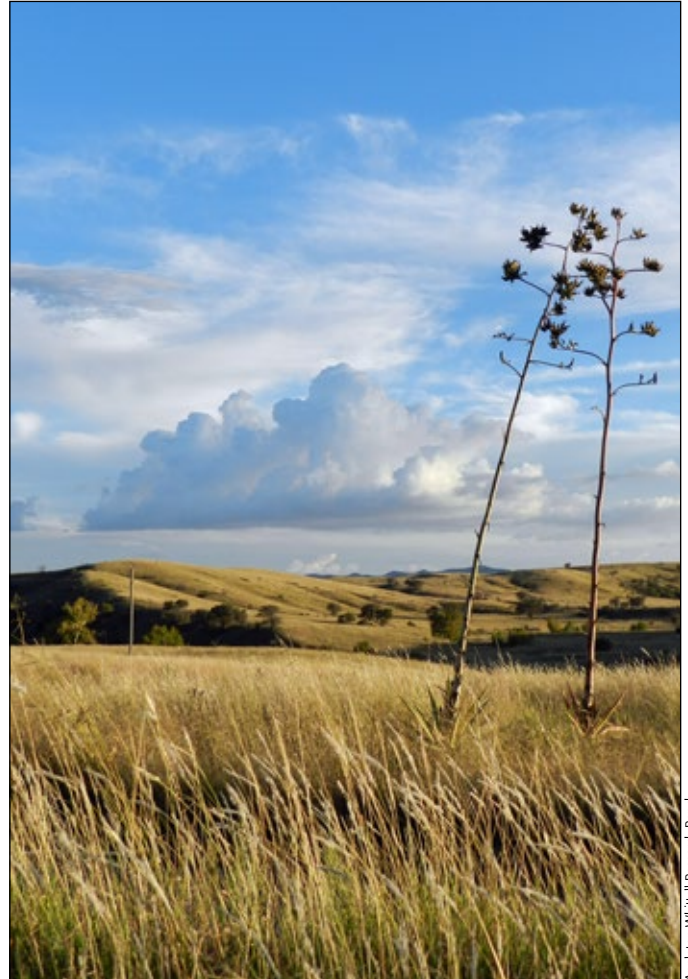
Apletion-Whitell Research Ranch

Human activities that might reap gain in the short-term merit analyzing for their long-term effects on the services that functioning natural systems deliver to all of us. If we continue to invest in nature, nature continues to provide returns to all of us.