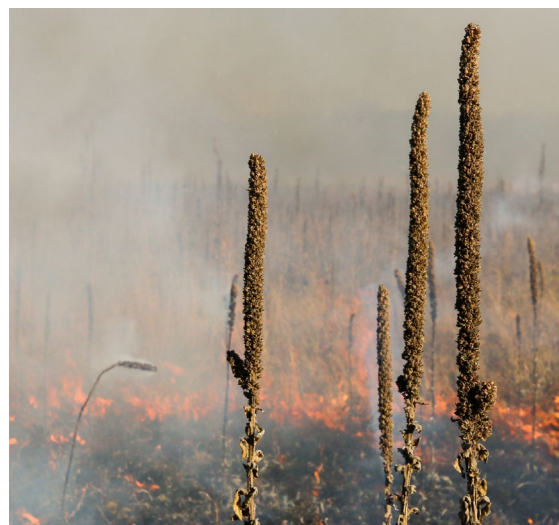
Camp Ripley Environmental Team sets fire to natural vegetation during a prescribed burn.