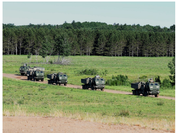
National Guardsmen from the 121st Field Artillery Regiment drive HIMARS through a live fire range at the Camp Ripley Training Center.

Recognizing the need to protect this landscape, the Minnesota legislature passed state law 190.33, which was signed into law by Governor Mark Dayton in May 2015. Under the law, the adjutant general convened a Sentinel Landscape Coordinating Committee to identify the boundaries of the Camp Ripley Sentinel Landscape and develop a suite of tools and programs that could provide technical and financial assistance to interested landowners within the sentinel landscape. With input from local government, stakeholders, and Federal agency partners, the Coordinating Committee identified the desired outcomes of the Camp Ripley Sentinel Landscape partnership: protecting the installation’s military training mission and the landscape’s wildlife management areas, watersheds, and agricultural resources.