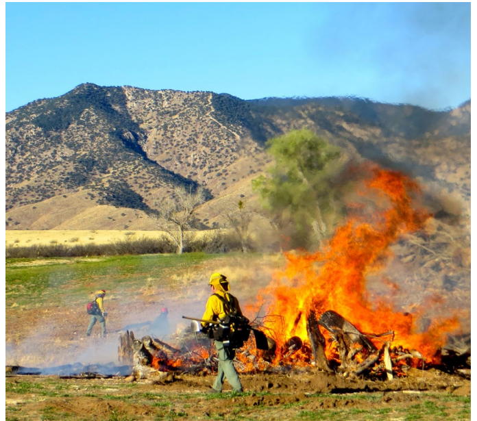
Fort Huachuca firefighters joined by firefighters from the Coronado National Forest, Bureau of Land Management, Douglas, Sierra Vista, and Whetstone conduct a prescribed burn to eradicate mesquite and other fuels.

Allocate resources strategically, considering future climate-related opportunities and risks for Fort Huachuca, the landscape, and local economies amidst potential challenges like wildfires, flooding, drought, and extreme heat.