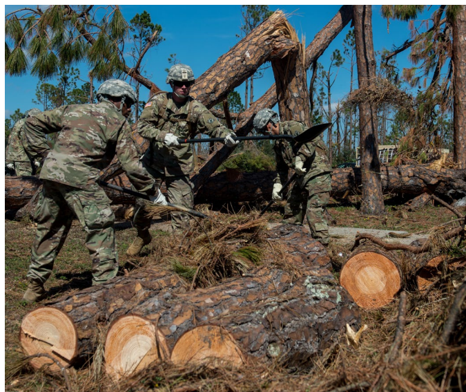
U.S. Army soldiers from the 46th Engineer Battalion moved tree debris into piles on Tyndall Air Force Base, Florida. After Hurricane Michael swept the area in 2018, multiple major commands mobilized relief assets in an effort to restore operations after the hurricane caused catastrophic damage to the base and surrounding communities.

In order to improve regional resilience and sustainability, retain working agriculture and forestry lands, protect natural resources and endangered species, and sustain the military mission, local, regional, state, and federal partners came together in 2022 to form the Northwest Florida Sentinel Landscape.