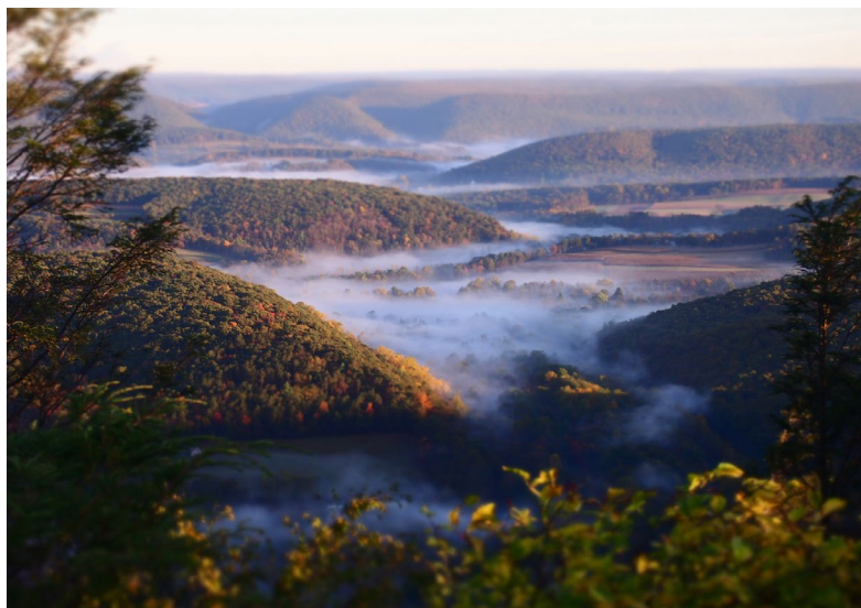
The Kittatinny Ridge is the gateway to Pennsylvania's Ridge and Valley Region.