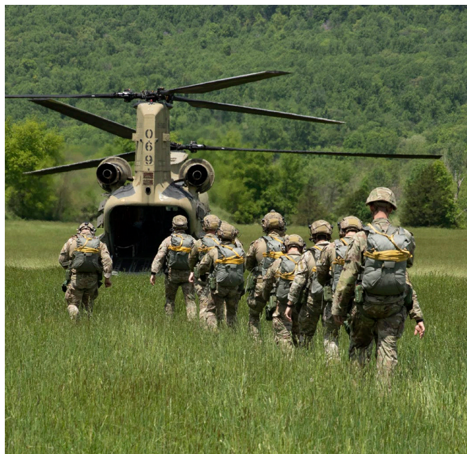
Service members board a Pennsylvania Army National Guard CH-47 Chinook during airborne training at Fort Indiantown Gap, Pennsylvania.

Improve nature-based recreational resources and access to sustain small-town economies.