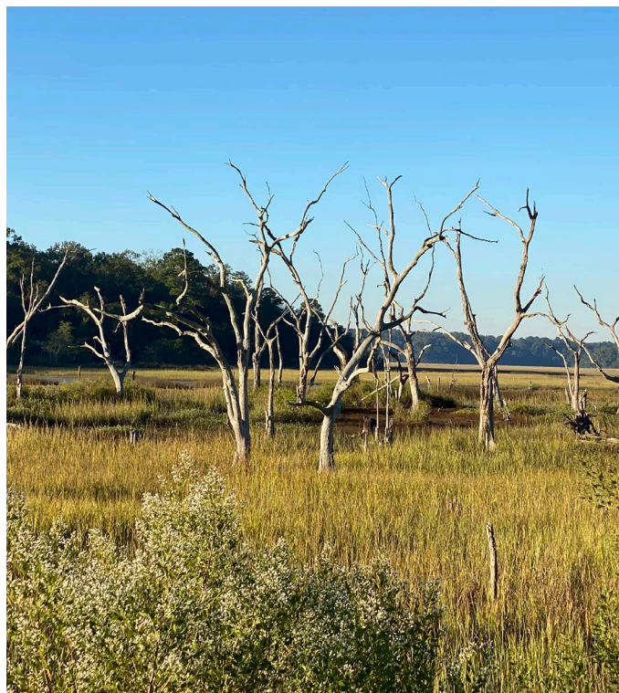
Ghost trees, like those seen along Huspah Creek, showcase the impact of sea level rise and salinity changes in the marsh migration process throughout the landscape.

Partners established the South Carolina Lowcountry Sentinel Landscape in 2023 to work on protecting ecologically significant areas, drinking water supplies, and working farmlands, all with the goal of maintaining long-term military readiness and climate resilience across the landscape.