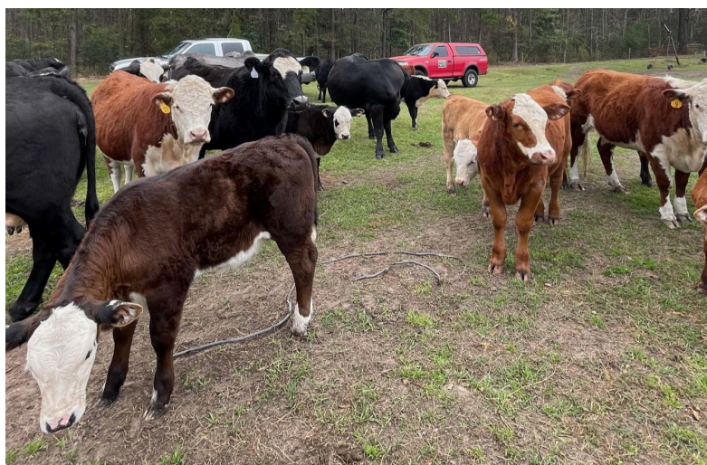
A cattle farm, protected with a conservation and restrictive easement through the active REPI program, safeguards farmland west of Marine Corps Air Station Beaufort.