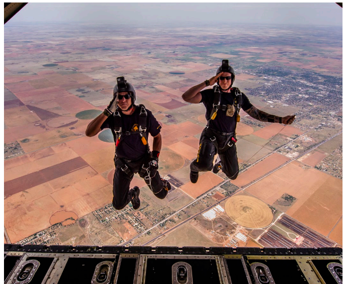
Two members of the U.S. Special Operations Command Para-Commandos salute as the jump out of a MC-130J Commando II aircraft during the Cannon Air Show, Space and Tech Fest at Cannon Air Force Base, New Mexico.

Promote the conservation of grasslands and playas to benefit wildlife, increase drought resiliency, and increase groundwater recharge for the regional community.