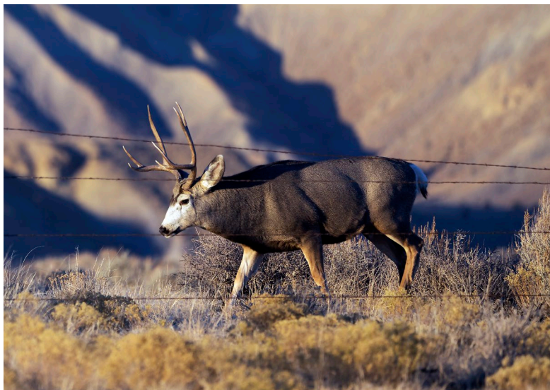
Mule deer are among the most watchable Utah wildlife and can generally be seen throughout the state during all seasons of the year.