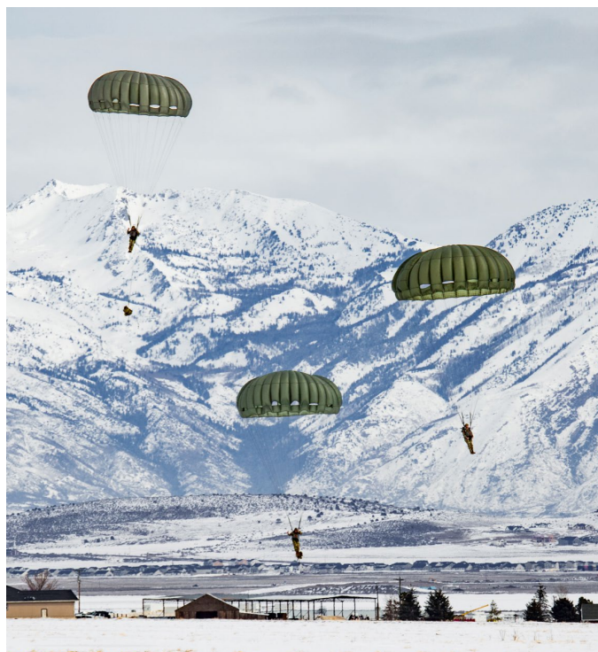
US Army Paratroopers assigned to the 19 th prepare to complete the proper landing procedures to prevent the risk of injuries during an Airborne jump on February 25, 2023 near Camp Williams.

Utah is one of the nation's fastest growing and driest states, presenting a host of challenges for partners in the Great Salt Lake Sentinel Landscape. Increased water diversions from tributaries that feed the Great Salt Lake are threatening some of the most critical waterfowl habitats in North America. Population growth has driven incompatible development around military installations, placing constraints on training activities. The Great Salt Lake Sentinel Landscape partners are committed to addressing these challenges and more by aligning interests, maximizing resources, and building resilience in Utah's military installations, communities, and ecosystems for decades to come.