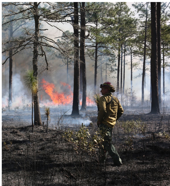
A forestry technician observes a prescribed burn in the LE training area at Marine Corps Base Camp Lejeune. Prescribed burns are used to effectively restore the native ecosystems and to reduce risk of an uncontrolled wild fire.

Facilitate the connection of partnership efforts across the landscape and provide support to existing partners anchored near the installations.