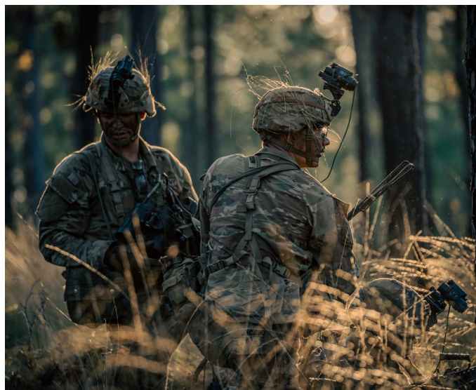
Paratroopers assigned to the 82 nd Airborne Division conduct patrol operations during the Small Unit Ranger Tactics (S.U.R.T.) qualification course on Fort Liberty, North Carolina.

Increase awareness of the Eastern North Carolina Sentinel Landscape's mission, its value to partners' stakeholders, and opportunities for expanded stakeholder participation.