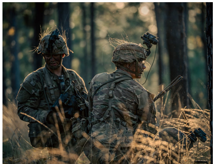
Paratroopers assigned to the 82 nd Airborne Division conduct patrol operations during the Small Unit Ranger Tactics (S.U.R.T.) qualification course on Fort Liberty, North Carolina.

Increase awareness of the Eastern North Carolina Sentinel Landscape’s mission, its value to partners’ stakeholders, and opportunities for expanded stakeholder participation.