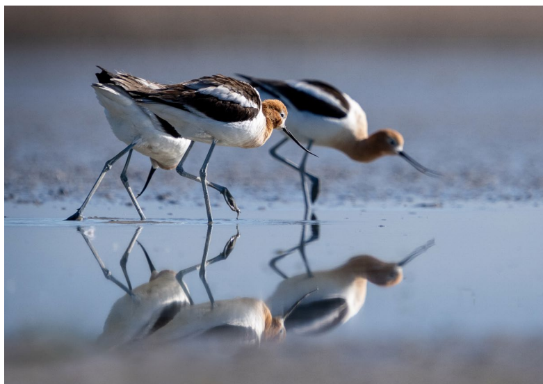
Migrating avocets stop to feed in the shallows off of Antelope Island on Great Salt Lake.