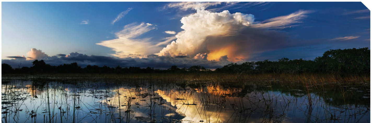
The Everglades "After the Storm"

educational opportunities. The sentinel landscape partners are committed to supporting the Everglades by improving the water quality, quantity, and storage capacity in the upper Everglades watershed. In pursuit of this objective, partners have enrolled 8,700 acres within the sentinel landscape in NRCS' Wetland Reserve Program and Wetlands Reserve Easements and 1,064 acres in South Florida Water Management District's Dispersed Water Management Program.