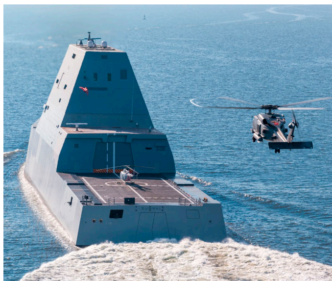
USS Zumwalt (DDG 1000) approaches the Gov. William Preston Lane Memorial Bridge, also known as the Chesapeake Bay Bridge.

Despite the landscape's historically agricultural and fishing-based economy, its location makes it an increasingly attractive area for residential and vacation home development. This growing demand presents a challenge for the partners within the sentinel landscape, whose individual missions can conflict with unfettered development. As a result, in 2015, a group of stakeholders formed the Middle Chesapeake Sentinel Landscape to enhance land protection and restoration efforts across the region to support military readiness, working and natural lands, and resilient communities and ecosystems. Since its inception, the MCSL has grown from an initial group composed of Federal agency partners to include representatives from 40 different organizations and agencies.