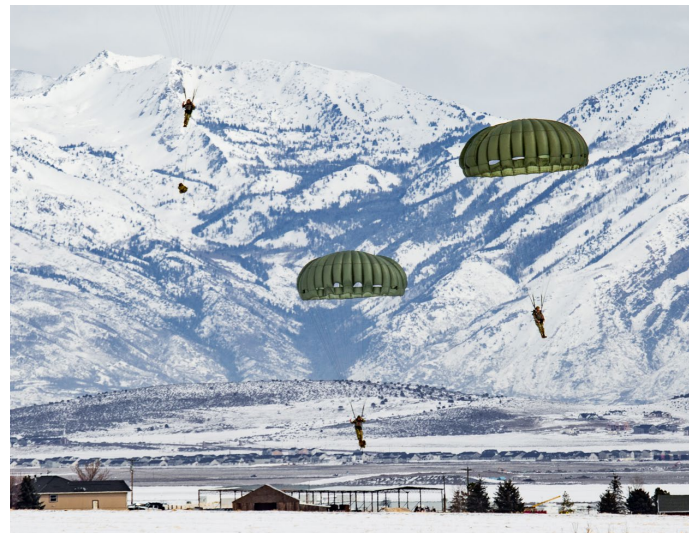
US Army Paratroopers assigned to the 19 th prepare to complete the proper landing procedures to prevent the risk of injuries during an Airborne jump on February 25, 2023 near Camp Williams.

Protect and preserve migratory bird and mule deer migration corridors through projects that safeguard critical habitat.