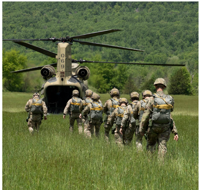
Service members board a Pennsylvania Army National Guard CH-47 Chinook during airborne training at Fort Indiantown Gap, Pennsylvania.

With the primary mission of preserving military mission readiness, operations, testing, and training capabilities, partners in the Kittatinny Ridge Sentinel Landscape are focused on increasing coordinated and holistic land conservation, natural resource protection, and stewardship initiatives. In supporting these working lands, the sentinel landscape further supports local outdoor recreation and small-town economies.