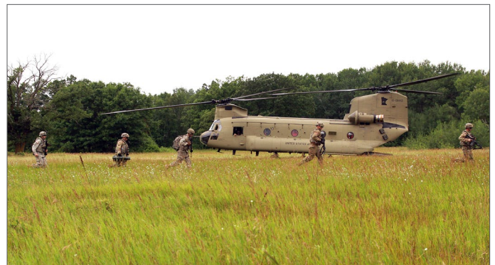
Soldiers conduct training exercises with a Chinook helicopter at Camp Ripley.

Intact rural and working lands provide important public benefits that bolster the local economy such as source and surface water protection, shoreline protection, open space, recreational opportunities for hunting and fishing, and commodity production. In 2015, the Minnesota legislature passed state statute 190.33 establishing the Camp Ripley Sentinel Landscape. Governor Mark Dayton signed the legislation to help identify and protect important national defense lands and their military missions. In 2016, Camp Ripley was designated as a federal Sentinel Landscape representing the formal partnership agreement between the U.S. Departments of Defense, Agriculture and Interior.