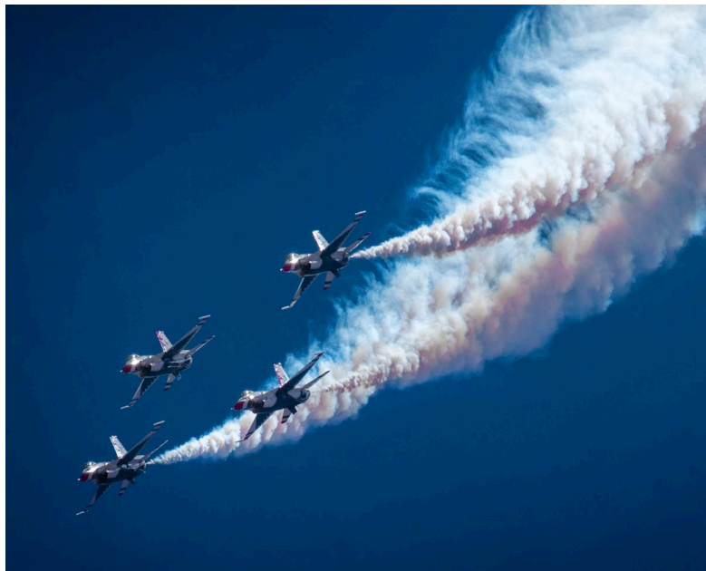
Four F-16 Fighting Falcons, assigned to the U.S. Air Force Aerial Demonstration Squadron, perform an aerial stunt during the Cannon Air Force Base Air, Space, and Tech Fest at Cannon AFB, New Mexico. The USAFADS Thunderbirds are stationed at Nellis Air Force Base in Las Vegas.