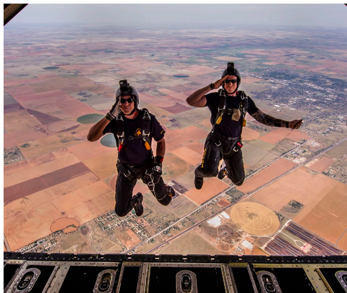
Two members of the U.S. Special Operations Command Para-Commandos salute as the jump out of a MC-130J Commando II aircraft during the Cannon Air Show, Space and Tech Fest at Cannon Air Force Base, New Mexico.

Promote the conservation of grasslands and playas to benefit wildlife, increase drought resiliency, and increase groundwater recharge for the regional community.