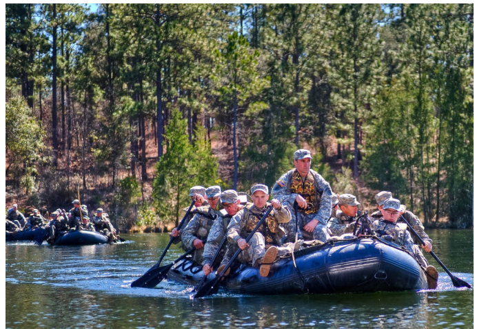
U.S. Army Ranger students paddle in rubber boats across a lake during the swamp training phase at Camp Rudder on Eglin Air Force Base, Florida.

In 2022, a coalition of local, regional, state, and Federal partners came together to establish the Northwest Florida Sentinel Landscape Partnership to sustain the military missions, improve regional sustainability, retain working agriculture and forestry lands, and protect natural resources and endangered species. The partnership was built on existing efforts in the region and continues to advance shared goals in adjacent, unprotected areas.