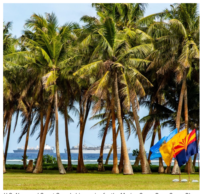
U.S. Navy and Coast Guard ships arrive for the Marine Corps Base Camp Blaz Reactivation & Naming Ceremony at Asan Beach.

Foster collaboration by integrating local knowledge and perspectives into land use planning, conservation efforts, and sustainable resource management.