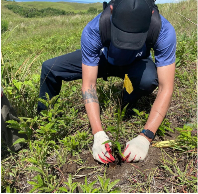
Volunteer assisting Guam Forestry and Soil Resources Division reforest fire prone savannah grasslands.