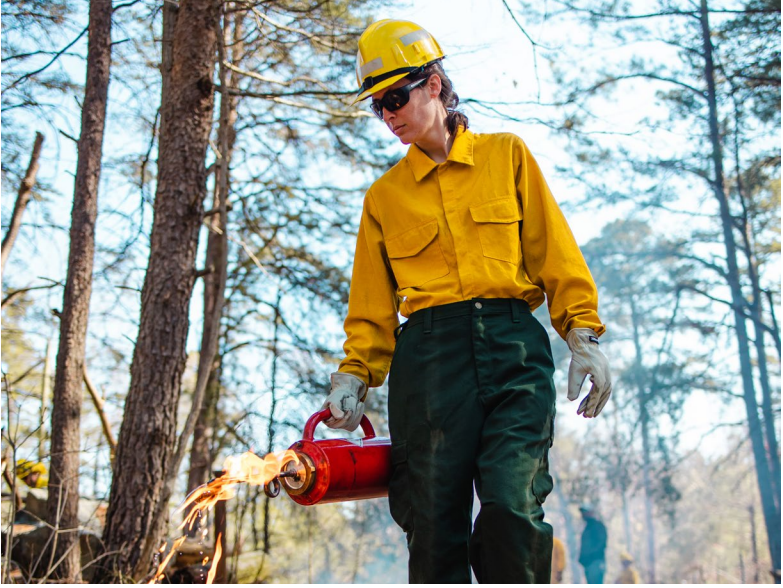
Controlled burn at Marine Corps Base Quantico