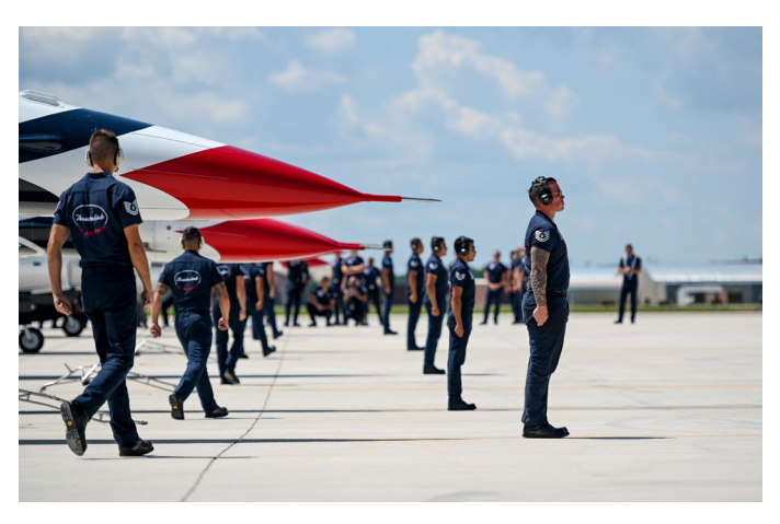
Air Force Thunderbirds practice at Joint Base Langley-Eustis

Focus on land concerns (encroachment, forest health, arable and conservation lands, fire/flood abatement) in the north, central, and southwestern regions and water quality concerns in the southeastern region, while ensuring complementary efforts across all regions.