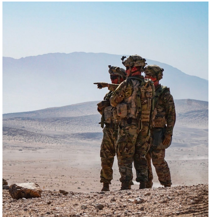
Soldiers assigned to 3 rd Armored Brigade Combat Team, 1 st Armored Division discuss their next training mission at Fort Irwin, California during rotation 18-08 the National Training Center.

Develop sustainable, resilient seed propagation agricultural practices and seed growing cooperatives.