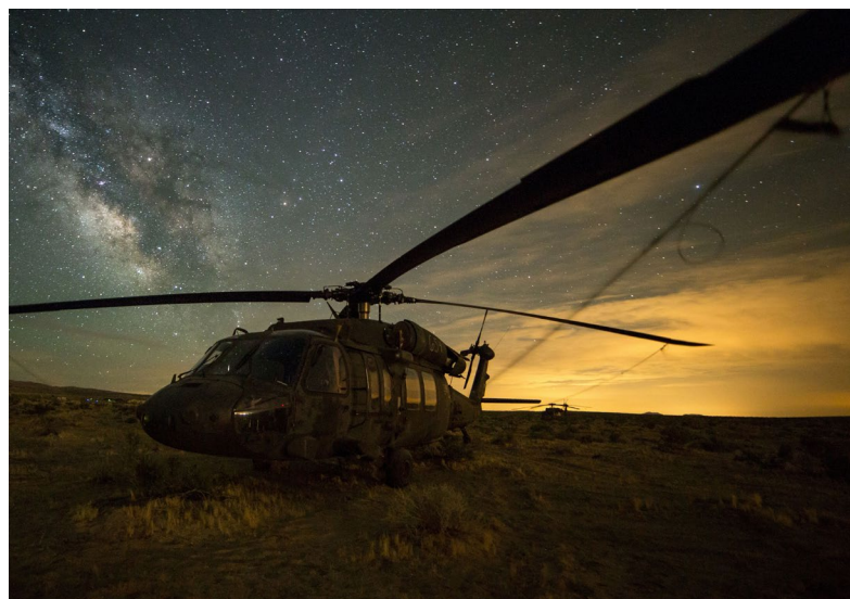
A UH-60 Blackhawk helicopter sits under Milky Way galaxy in the Mojave Desert, at the National Training Center, Fort Irwin, California.