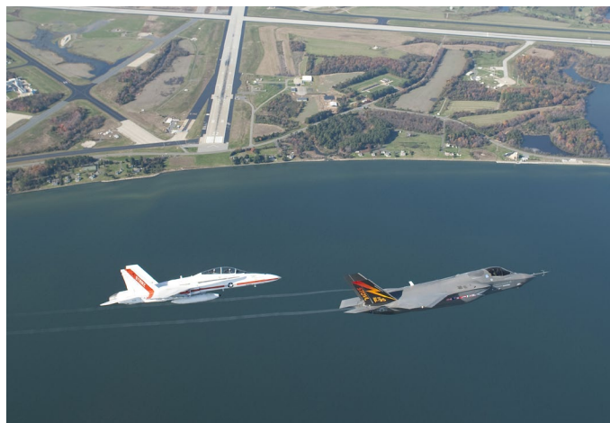
NAS Patuxent River and the Atlantic Test Ranges is an important testing location for all Navy aircraft, such as the F-35.

Despite the landscape's historically agricultural and fishing-based economy, its location makes it an increasingly attractive area for residential and vacation home development. This growing demand presents a challenge for the partners within the sentinel landscape, whose individual missions can conflict with unfettered development. As a result, in 2015, a group of stakeholders formed the Middle Chesapeake Sentinel Landscape to enhance land protection and restoration efforts across the region to support military readiness, working and natural lands, and resilient communities and ecosystems. Since its inception, the MCSL has grown from an initial group composed of Federal agency partners to include representatives from 40 different organizations and agencies.