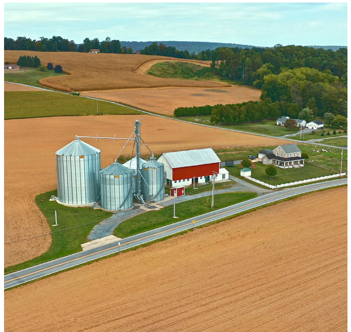
Agriculture is a key land use in the KRSL, especially in its valleys, where there are prime farmlands.

Rapid population growth and development around the Kittatinny Ridge Sentinel Landscape’s main highways have decreased open space and increased light pollution, threatening FTIG’s nighttime training capabilities. These pressures impact military installations specializing in Air and Missile Defense; sensitive species, like the eastern regal fritillary butterfly and cerulean warbler; ecosystem services, including drinking water, farm products, and timber; recreational resources; and climate change resilience. Currently, only 20 percent of the Kittatinny Ridge Sentinel Landscape is protected, which has attracted a myriad of partners to collaborate on strategic actions aimed at protecting the natural resources of this landscape.