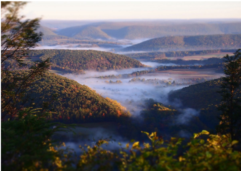
The Kittatinny Ridge is the gateway to Pennsylvania's Ridge and Valley Region.