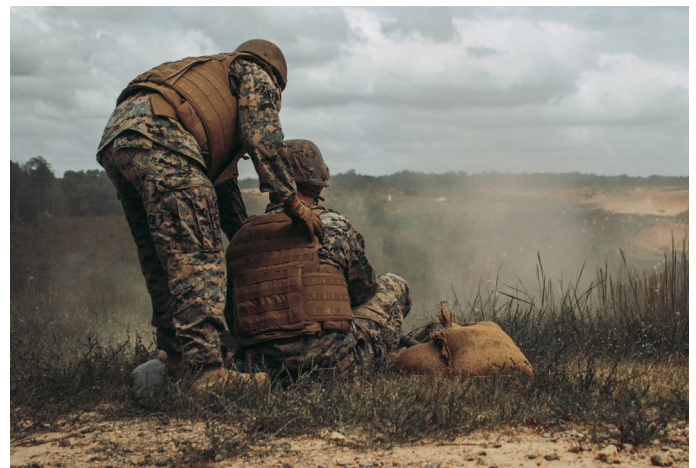
U.S. Marines with Security Battalion, Marine Corps Base Quantico, fire an M2A1 while participating in a machine gun range on MCB Quantico, Virginia.

Strengthen partnerships between military bases and surrounding communities to support long-term regional stability (encourage land management that reduces drought and fire risk, etc.).