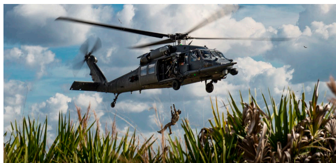
A pararescueman from the 38 th Rescue Squadron rides a hoist back into a 41 st RQS HH-60G Pave Hawk during a 'spin-up' exercise at Avon Park Air Force Range, Florida.

Protect and conserve water resources by buffering rivers, protecting aquifer recharge areas, and improving water quality.