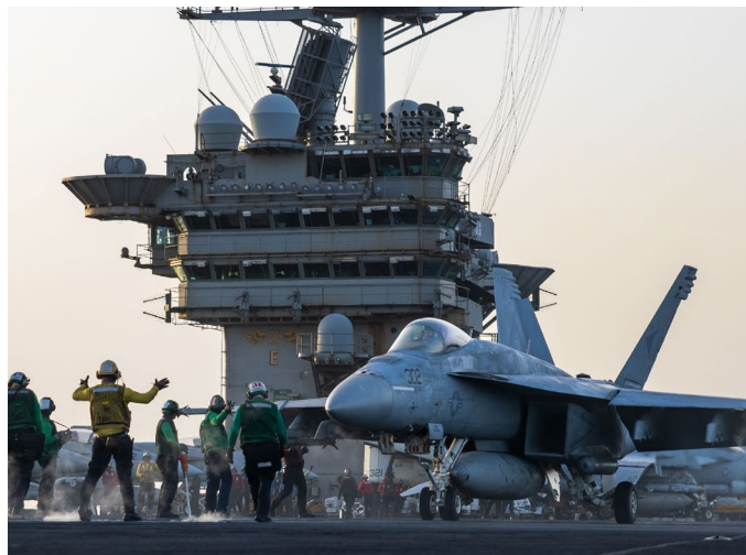
An F/A-18E Super Hornet, attached to Strike Fighter Squadron (VFA) 81, prepares for launch on the flight deck of the Nimitz-class aircraft carrier USS Harry S. Truman (CVN 75) during flight operations in the U.S. Central Command area of responsibility.

Leverage partners' subject matter expertise and financial assets for cost-effective, multi-benefit goal attainment.