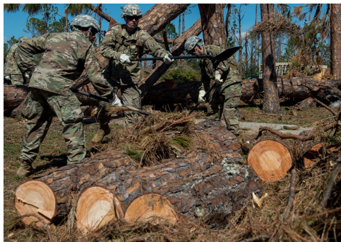
U.S. Army soldiers from the 46th Engineer Battalion moved tree debris into piles on Tyndall Air Force Base, Florida. After Hurricane Michael swept the area in 2018, multiple major commands mobilized relief assets in an effort to restore operations after the hurricane caused catastrophic damage to the base and surrounding communities (U.S. Air Force photo by Senior Airman Sean Carnes).

Identify, implement, and accelerate collaborative projects to enhance resilience to protect military missions, community infrastructure, and habitats.