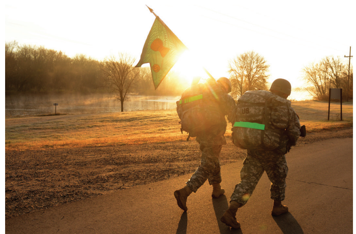
U.S. Army officer candidates, from the Minnesota National Guard Officer Candidate School, conduct a 10-mile ruck march at Camp Ripley, Minnesota.

The Camp Ripley Sentinel Landscape encompasses 40 minor watersheds, 50 miles of the Mississippi River, 49,000 acres of water bodies, the 2,000-acre Crane Meadows National Wildlife Refuge, and 42,000 acres of public land. Over one million people reside between Camp Ripley and Minneapolis, a vast majority of which rely on the Mississippi River for drinking water. This makes the sentinel landscape one of Minnesota's most important drinking water source protection areas. As a result, local communities are deeply committed to projects that enhance the quality of the region's water resources. In 2017, NRCS RCPP granted a network of 11 partners within the sentinel